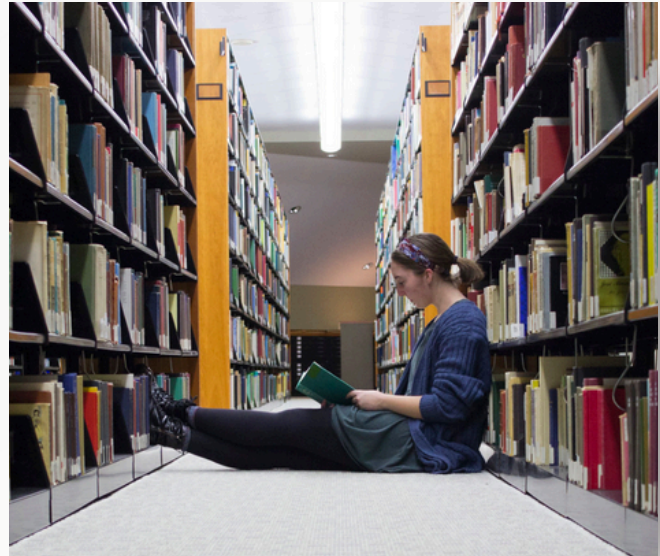
Hanover College Duggan Library

*Fall 2023 enrollment according to Integrated Postsecondary Education Database System ( https://nces.ed.gov/ipeds ).